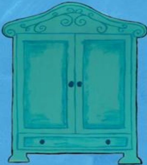
..... de kast