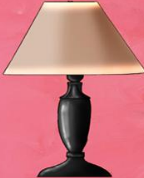
..... de lampe