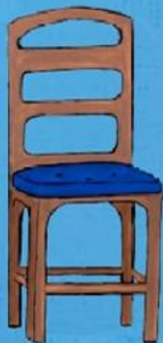
..... de stoel