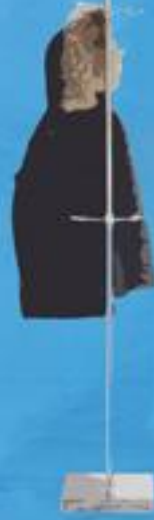
..... de kaptok